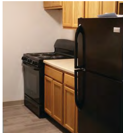
A new apartment kitchen at Colt Arms. The owners are investing $12 million in the building.