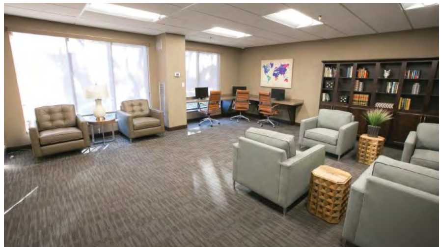
GHC Housing Partners' rehab of Bicentennial Tower not only upgraded the dwelling units; it also improved the common areas to encourage more interaction and socialization among the senior residents.

The financing also included 4% low-income housing tax credits and tax-